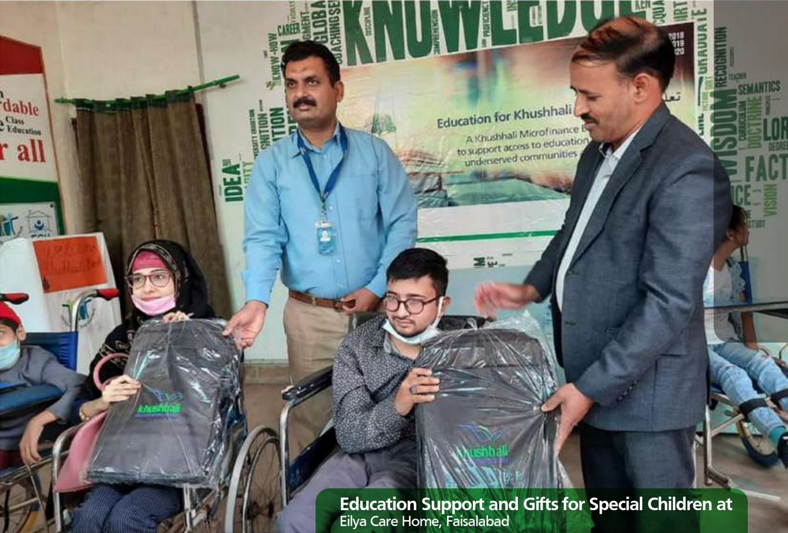
Education Support and Gifts for Special Children at Eilya Care Home, Faisalabad