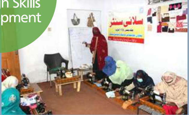
Stitching Training for Women at Chak No 1/10 L Harapa, Sahiwal