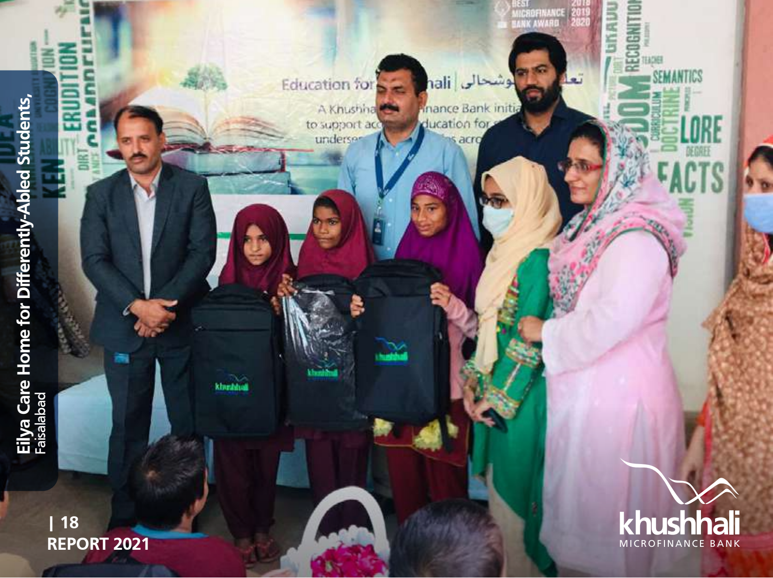
Eilya Care Home for Differently-Abled Students, Faisalabad