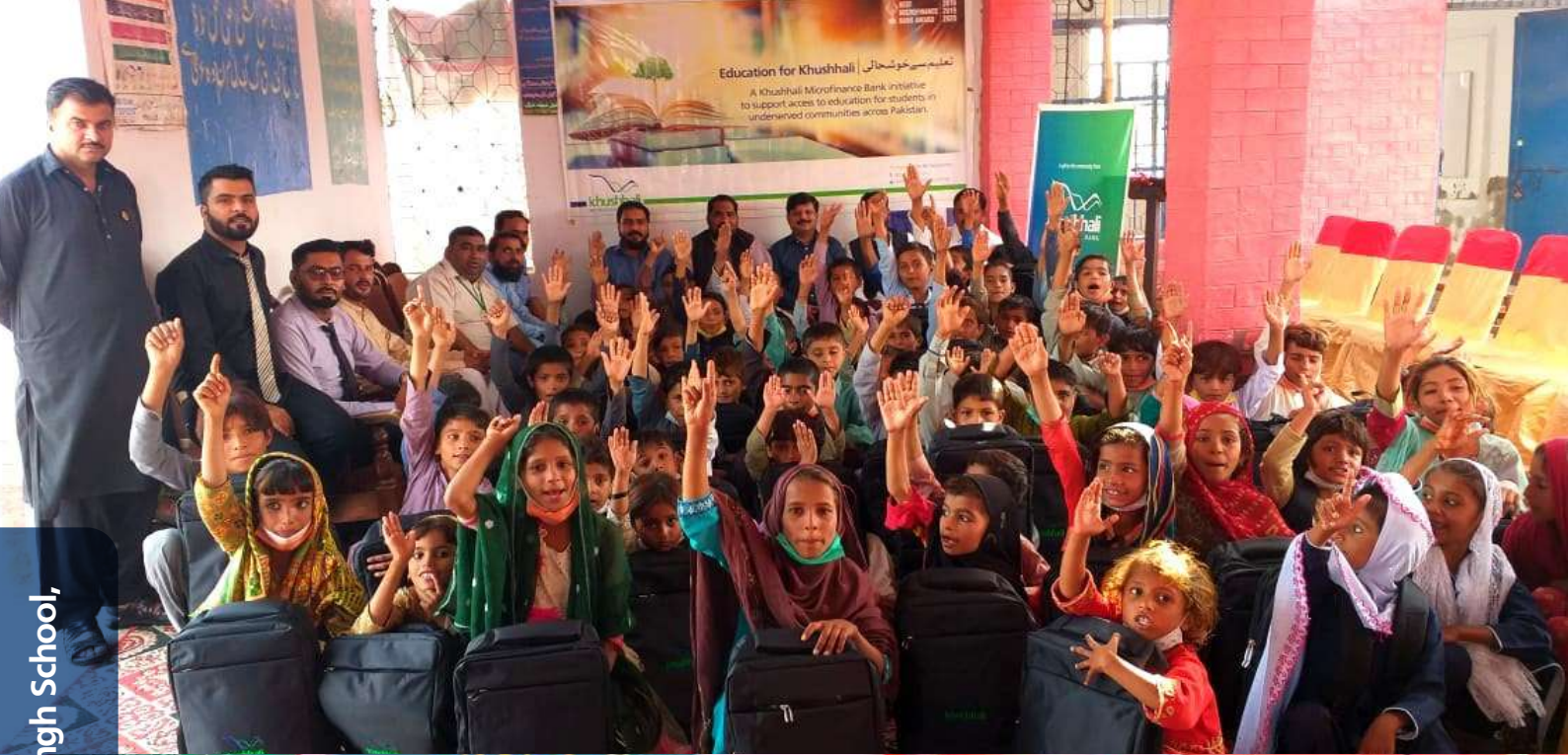
Government Shamla Langh School, Zahir Pir, Rahim Yar Khan