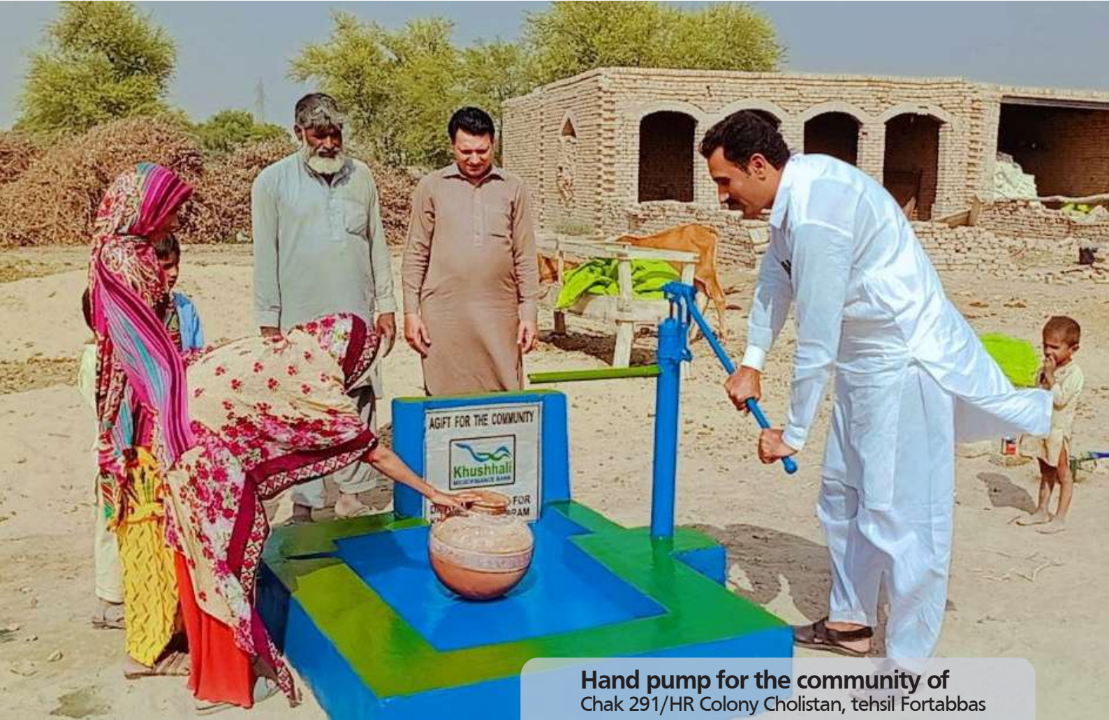
Hand pump for the community of Chak 291/HR Colony Cholistan, tehsil Fortabbas