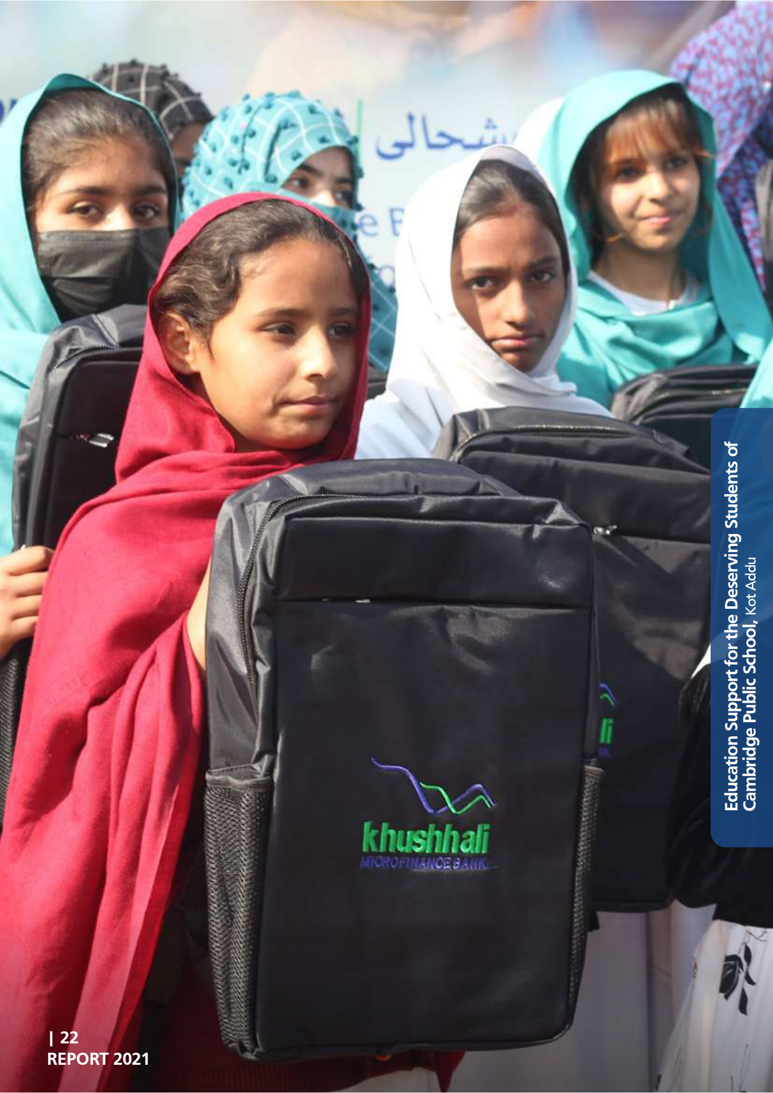
Education Support for the Deserving Students of Cambridge Public School, Kot Adlu