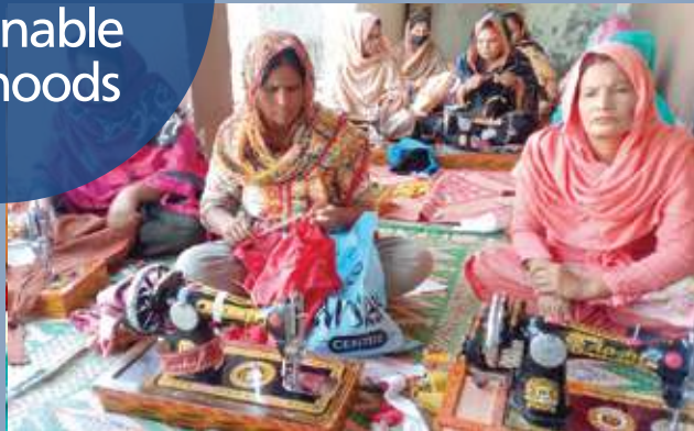
Stitching Training for women at Chak 367 Jallianwala, Gojra Faisalabad