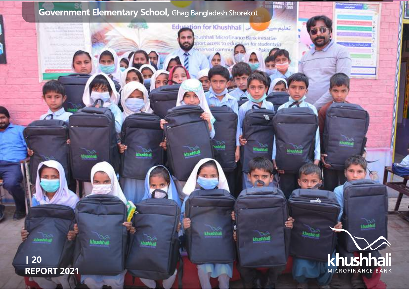
Government Elementary School, Ghag Bangladesh Shorekot