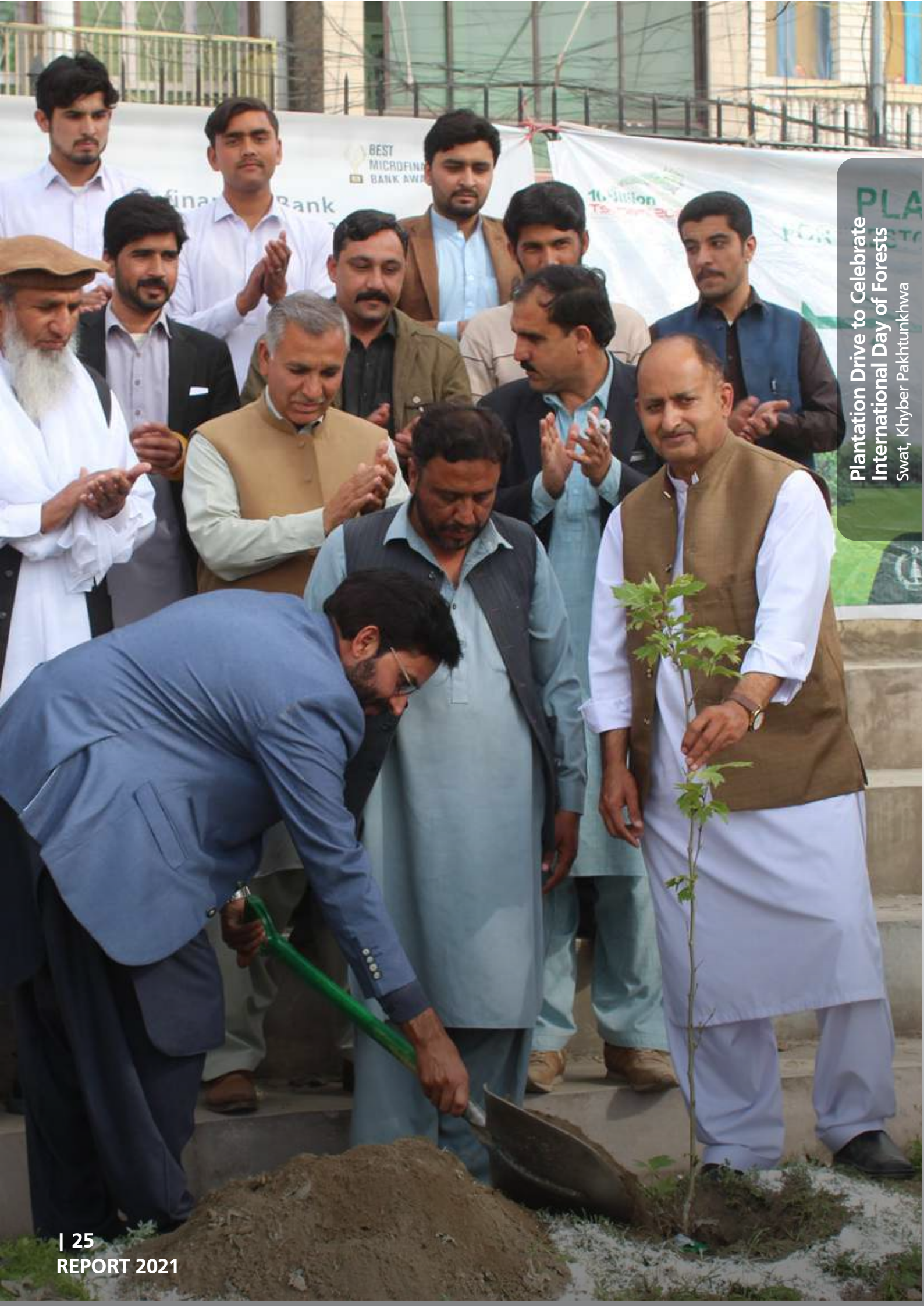
Plantation Drive to Celebrate International Day of Forests Swat, Khyber Pakhtunkhwa