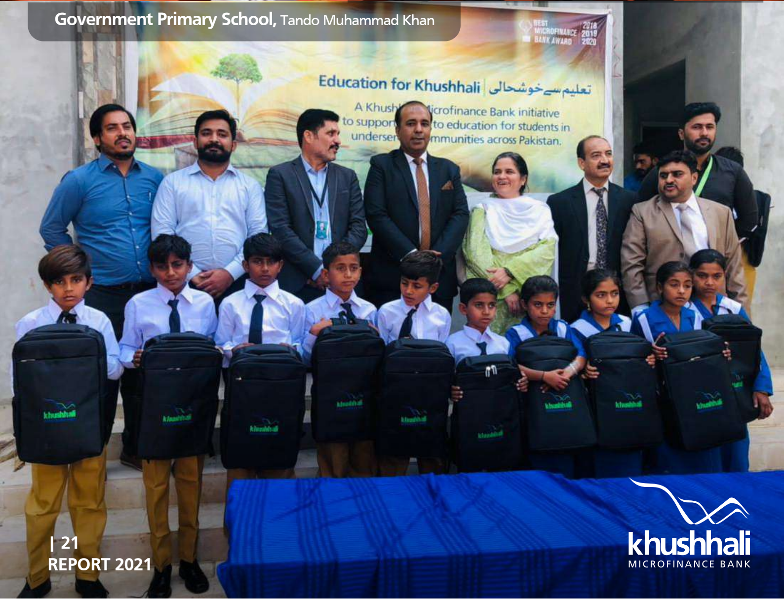
Government Primary School, Tando Muhammad Khan