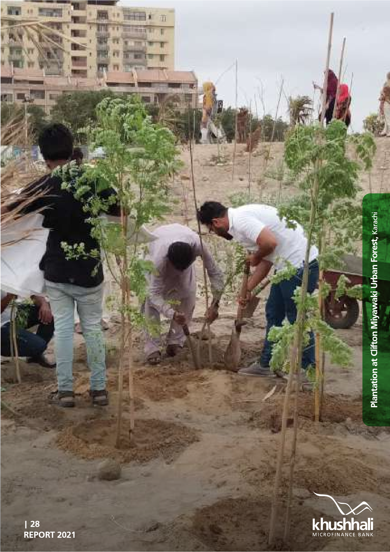
Plantation at Clifton Miyawaki Urban Forest, Karachi