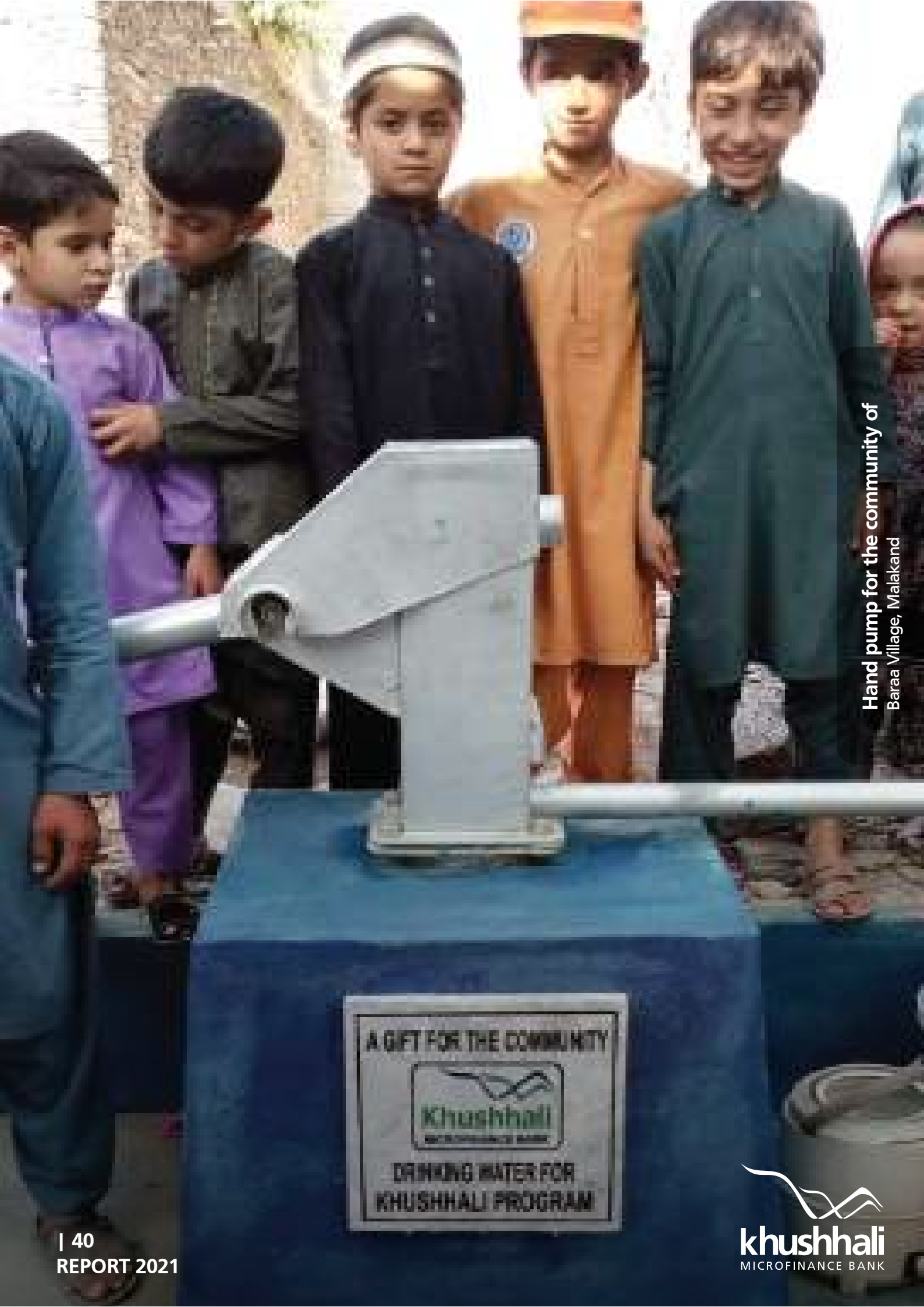
Hand pump for the community of Baraa Village, Malakand