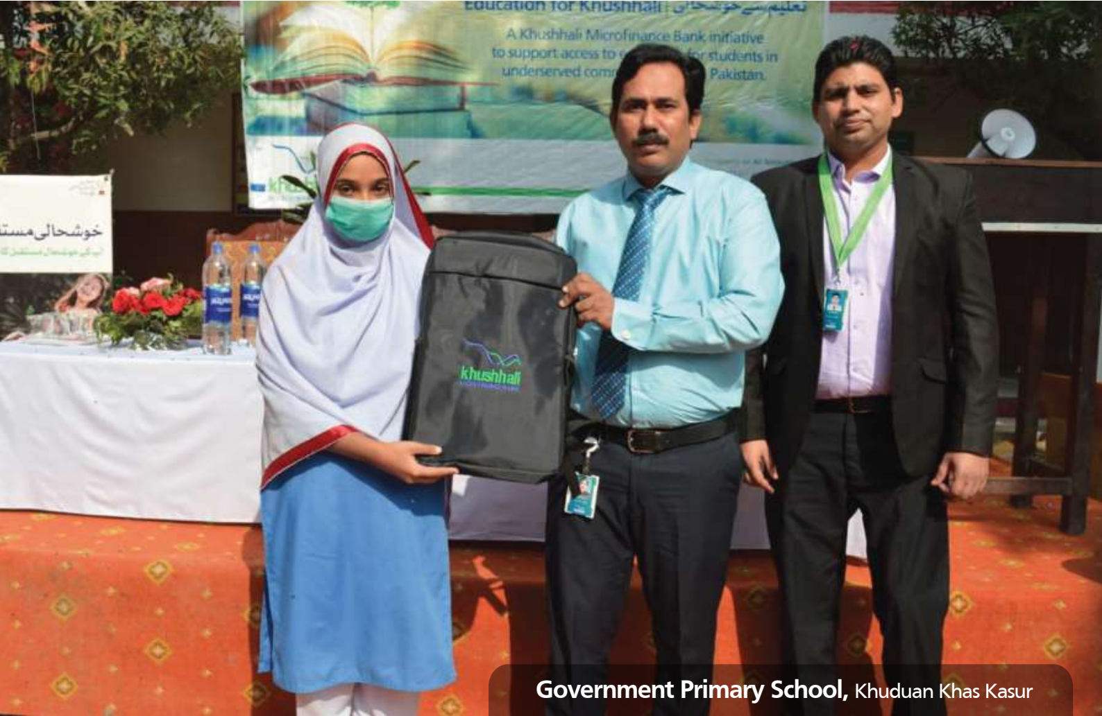
Government Primary School, Khuduan Khas Kasur