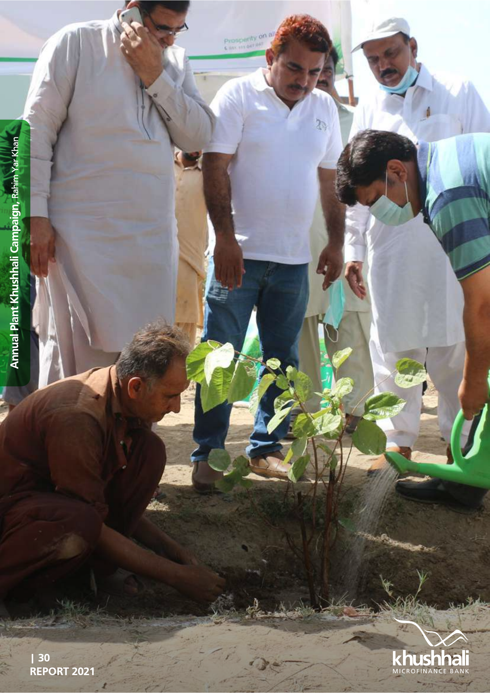
Annual Plant Khushhali Campaign, Rahim Yar Khan