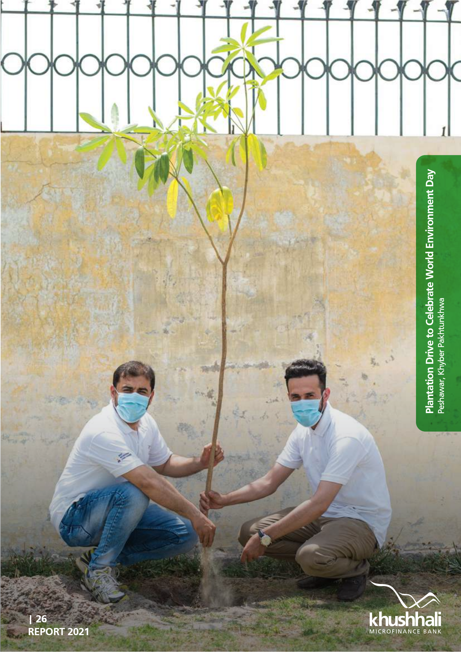
Plantation Drive to Celebrate World Environment Day Peshawar, Khyber Pakhtunkhwa