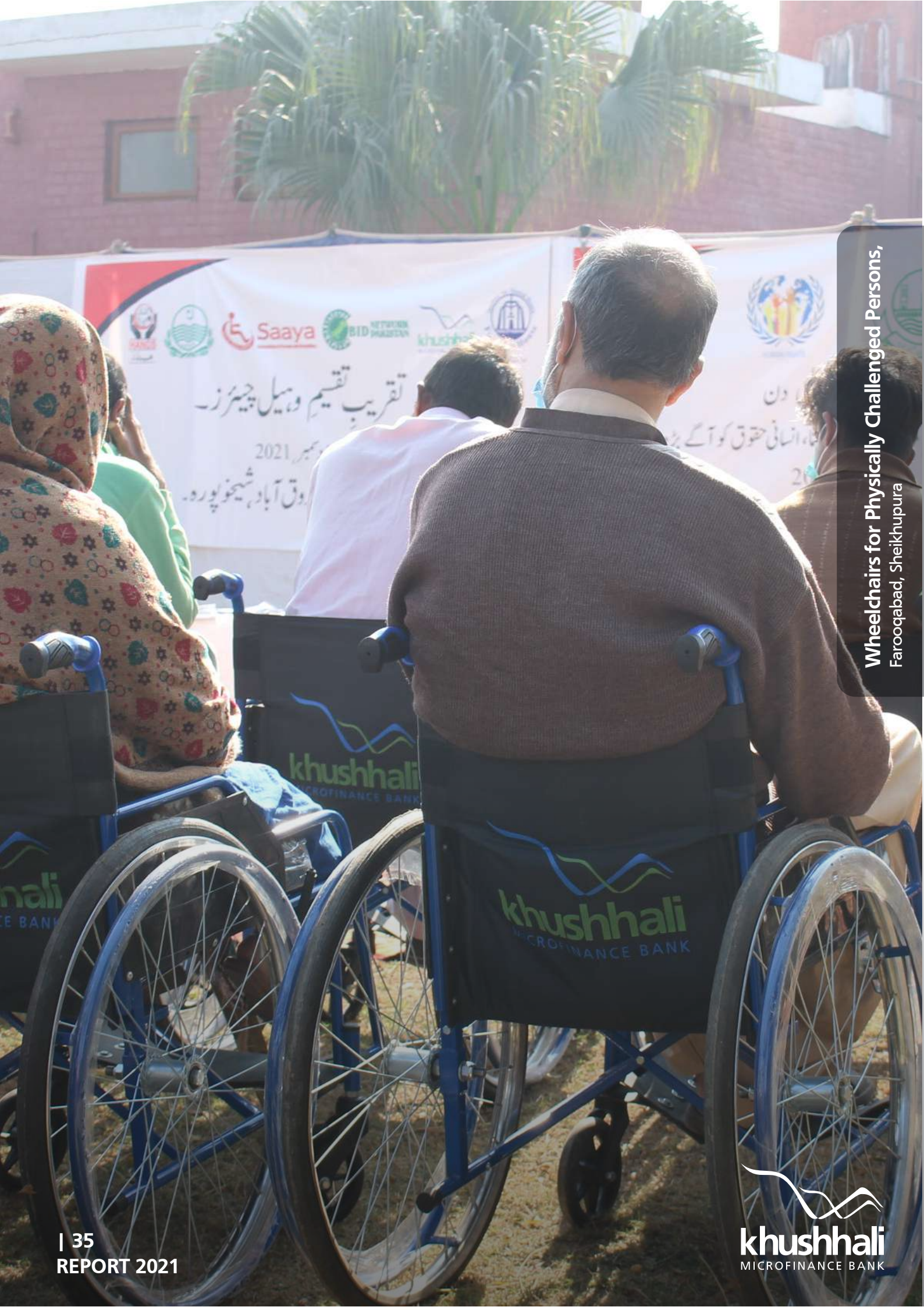
Wheelchairs for Physically Challenged Persons, Farooqabad, Sheikhpura