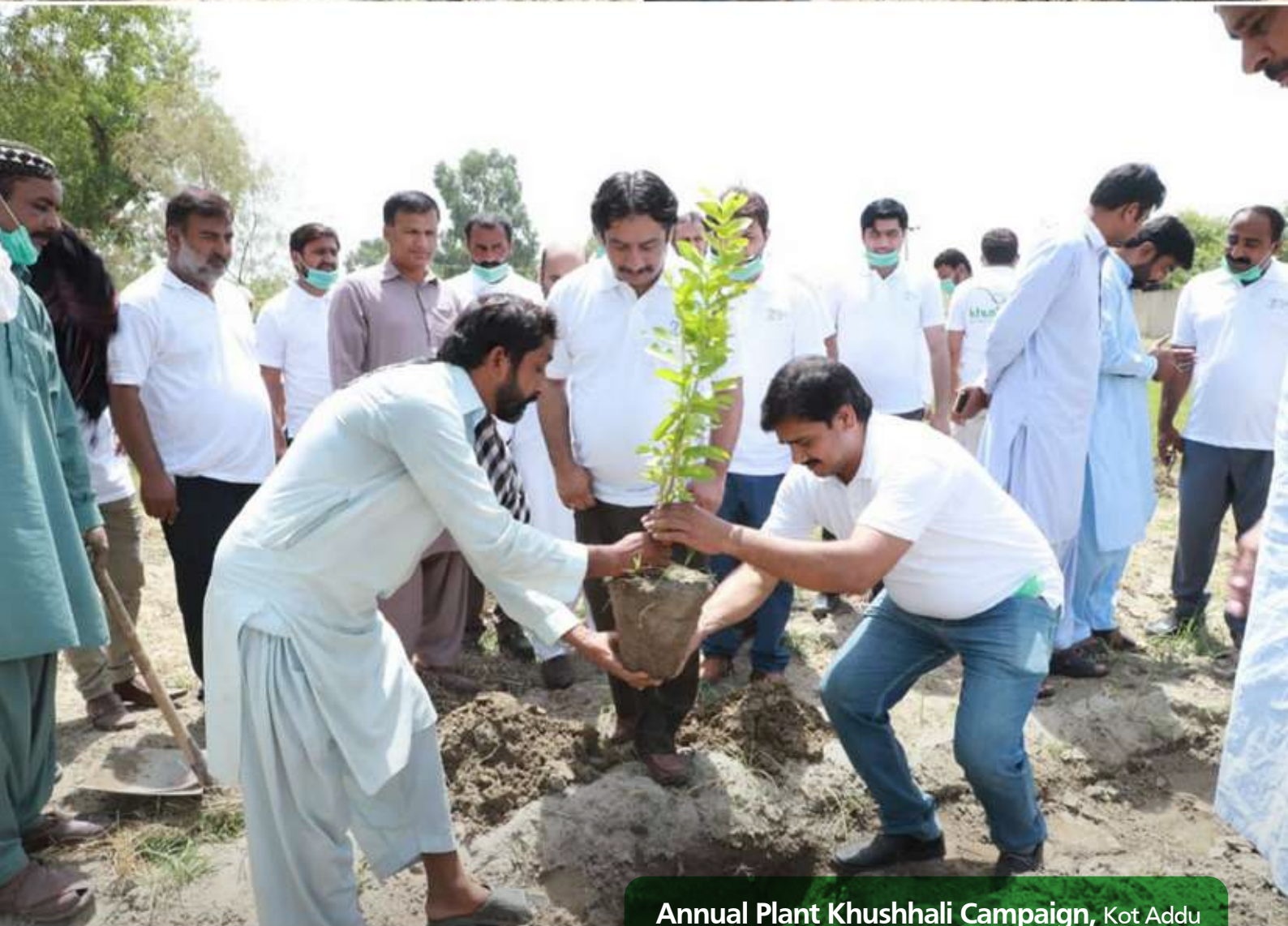
Annual Plant Khushhali Campaign, Kot Addu