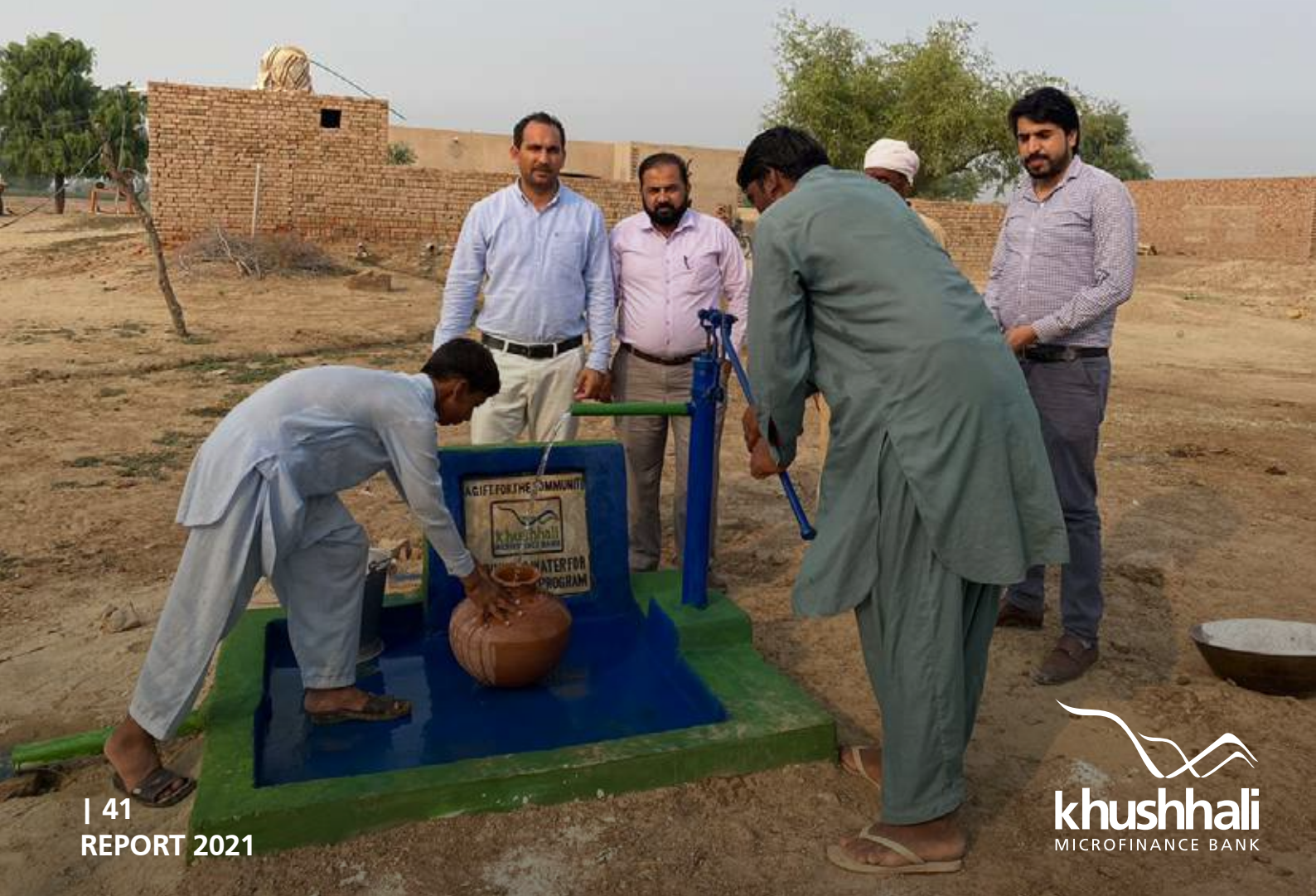
Hand pump for the community of Azafi Basti Mustafabad Chak No. 340/H.R, Marot