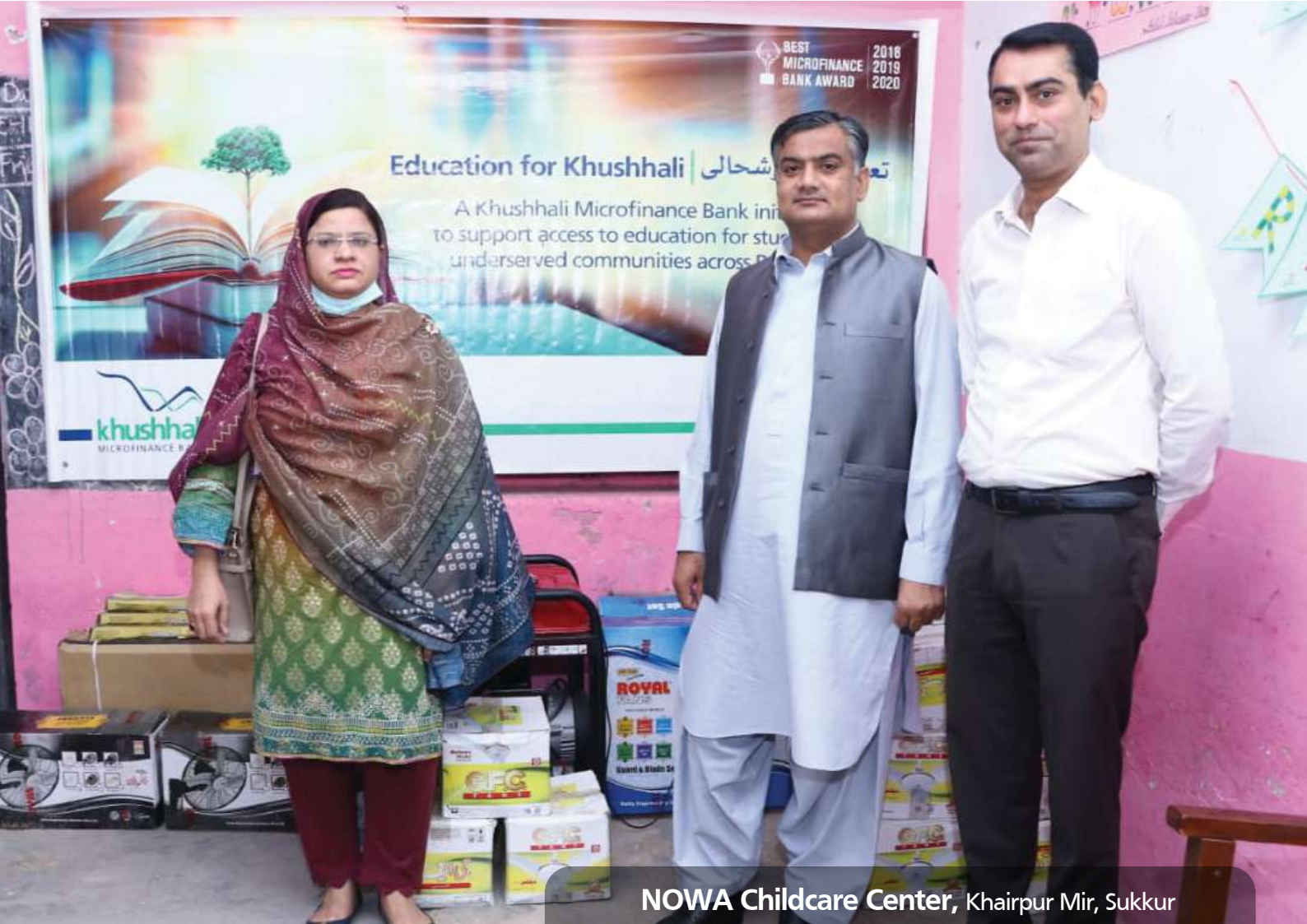
NOWA Childcare Center, Khairpur Mir, Sukkur